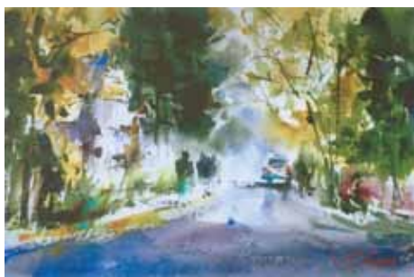
Watercolor painting by Karen Cooper

https://oakroomartists.wordpress.com/2014/04/27/karen-cooper/