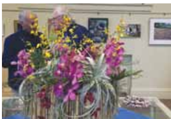
Floral arrangement by Studio Herbage